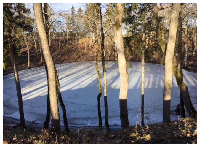
Visiting meteorite crater in Saarenmaa.